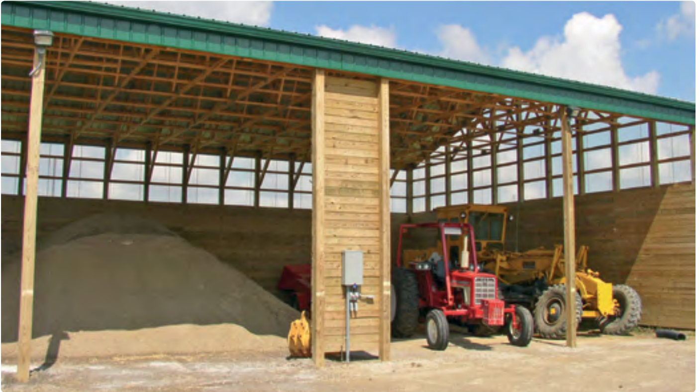
Storage Shed - USA