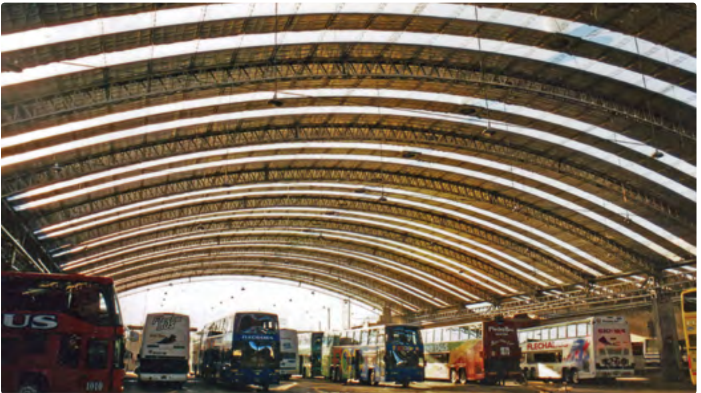
Central Bus Station - Argentina