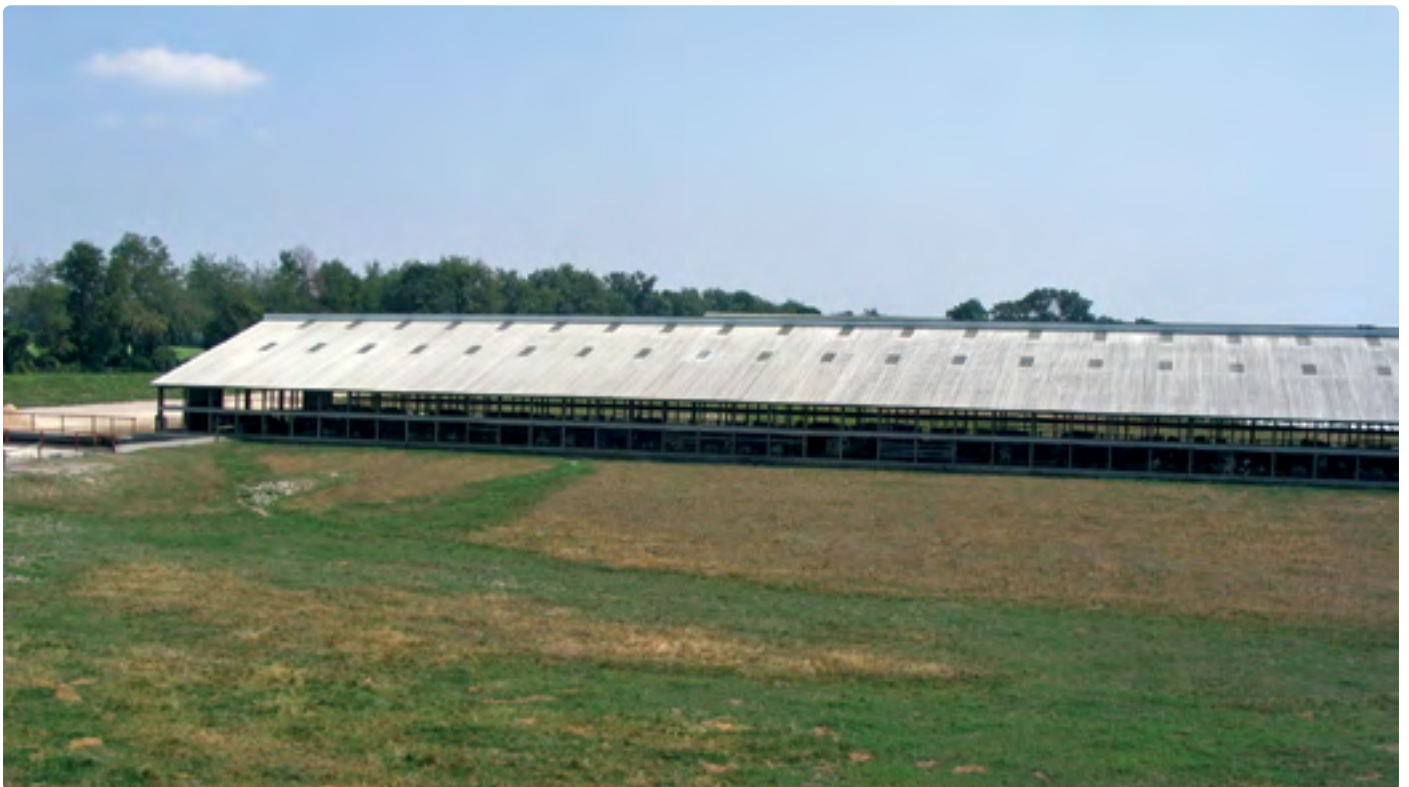
Cow Shed - USA