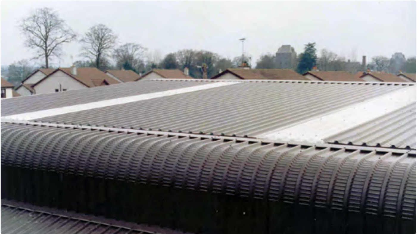
Industrial Warehouse - UK