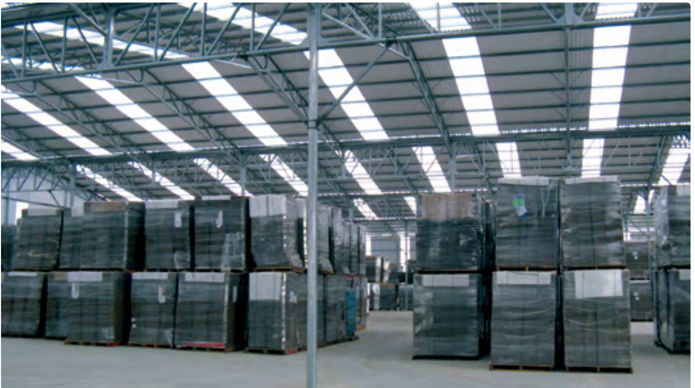
Industrial Warehouse - Israel