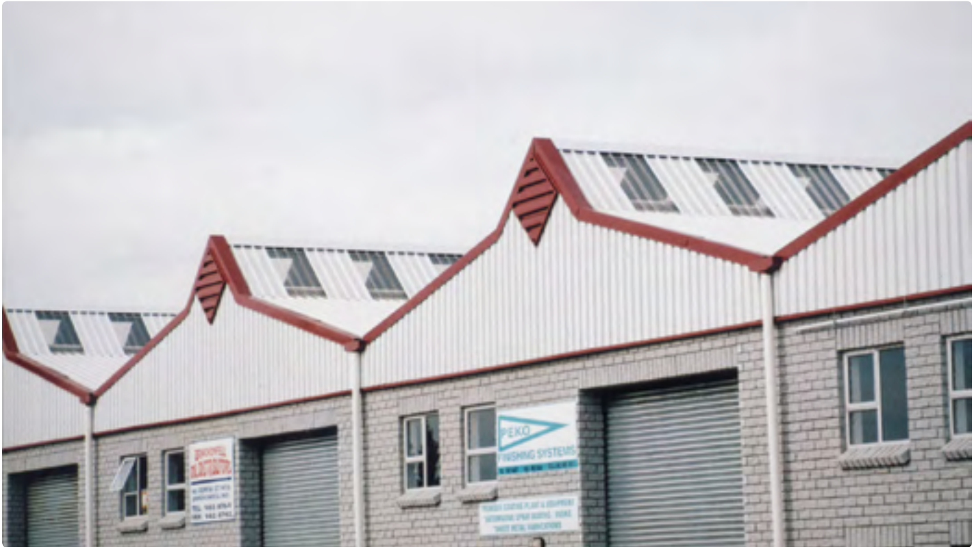
Industrial Warehouse - South Africa