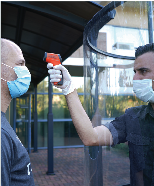
High clarity shield with frontal aperture