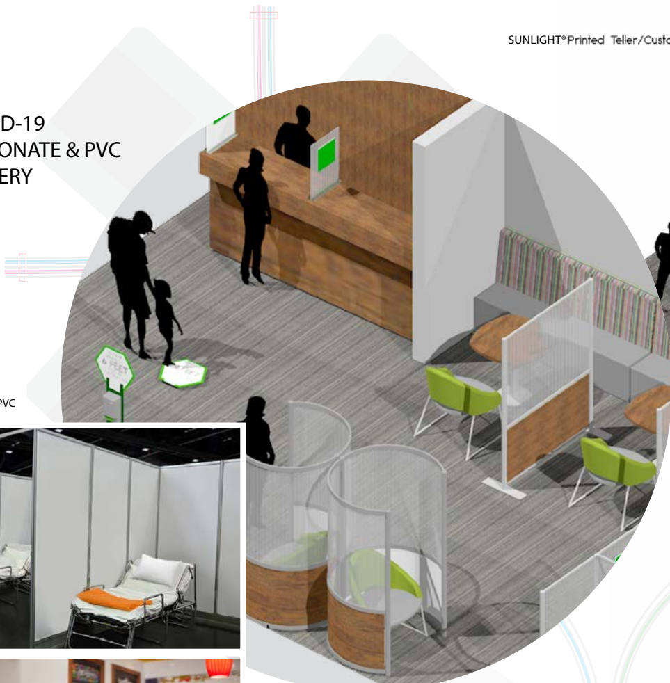
SUNLIGHT® Printed Teller/Customer Protection