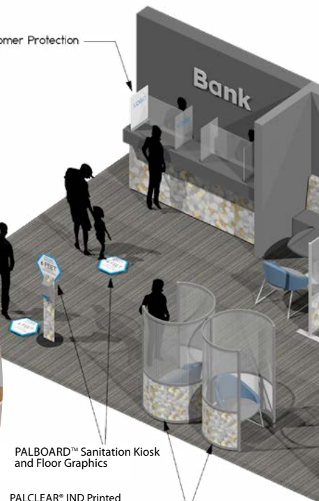
PALBOARD™ Sanitation Kiosk and Floor Graphics