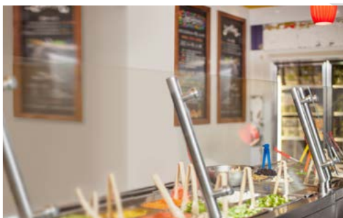
< PALCLEAR® - Clear PVC