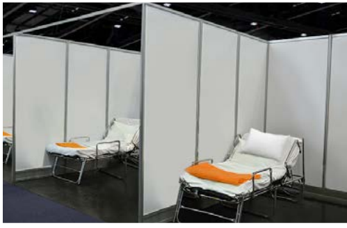
PALIGHT® - Foam PVC