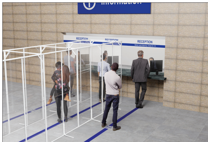
Enables the fast building of corridors systems