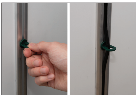
Hangers for the connection of wires / pipes