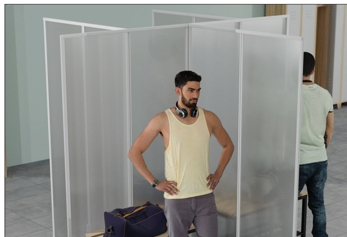
Modular partition of sanitary areas