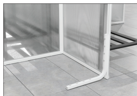
Stabilizing / anchoring system