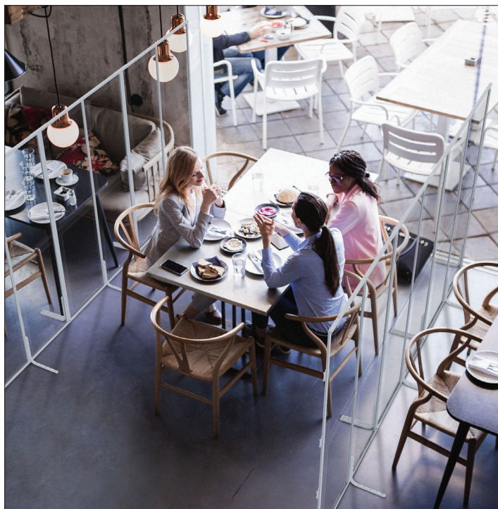
Allows simple setup of parted areas

Fast-assembly, lightweight, ultra-resilient building kits